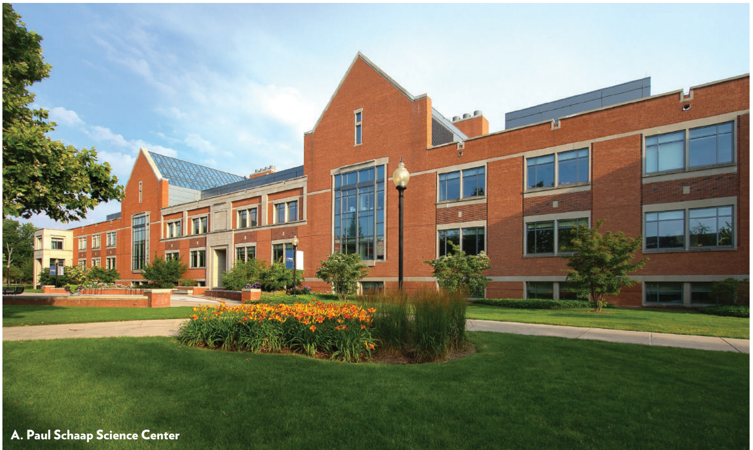
A. Paul Schaap Science Center