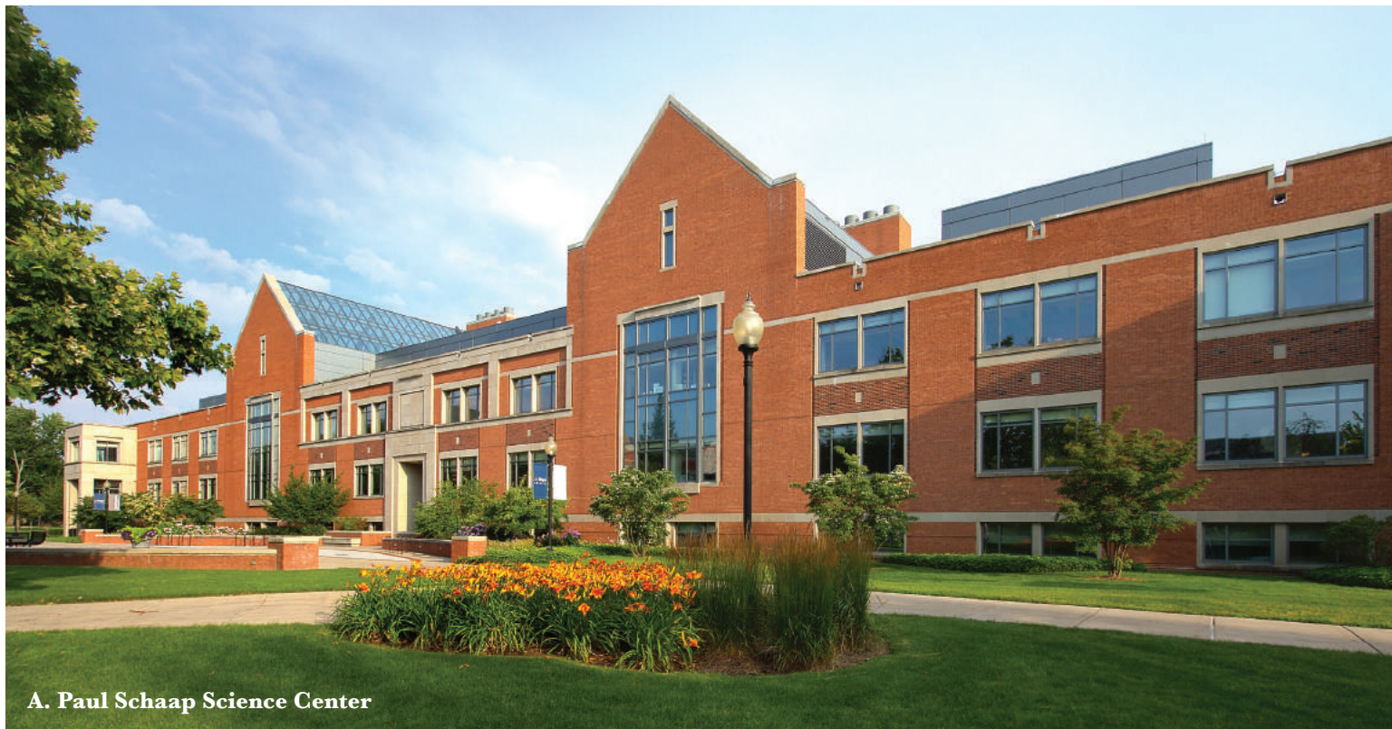
A. Paul Schaap Science Center