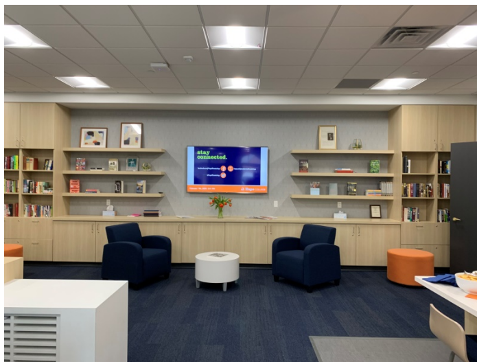
Library and Gathering Space