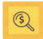
Drug Price Lookup