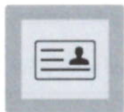
My ID Card